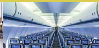
In Flight & Cruise Ships

Reach travelers on the go through displays in airport terminal's and rewards clubs. Target a captive audience with a buying mindset.